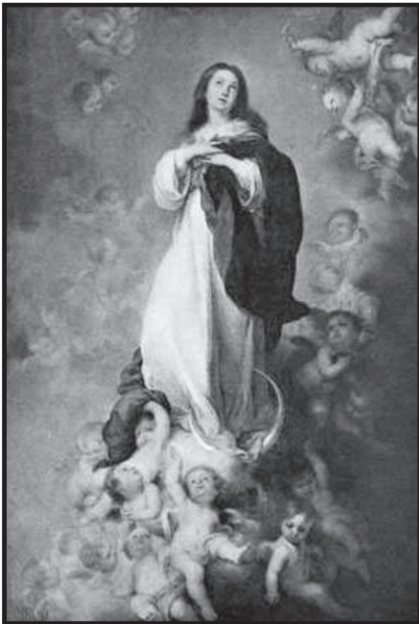
The Assumption by Murillo