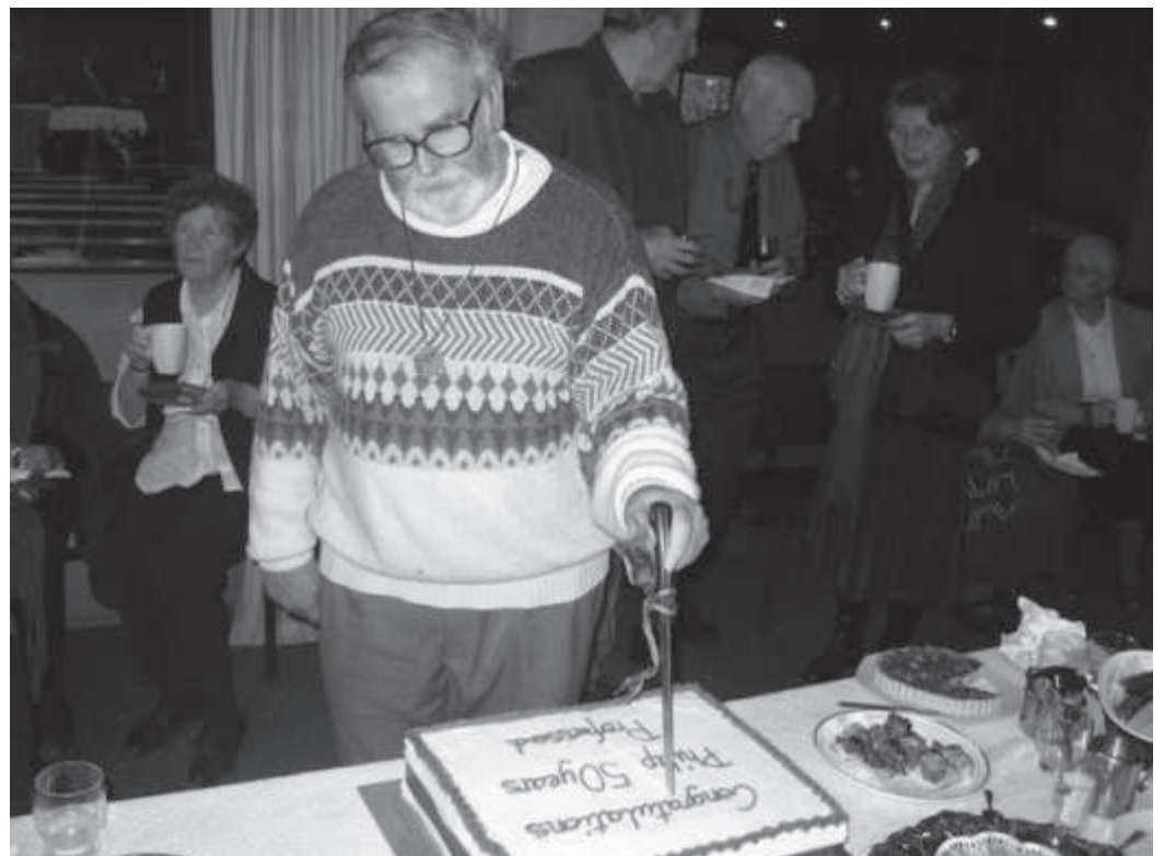
The Liturgical Cake Cutting Ceremony